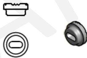
ARCS (ARC SHIELD)